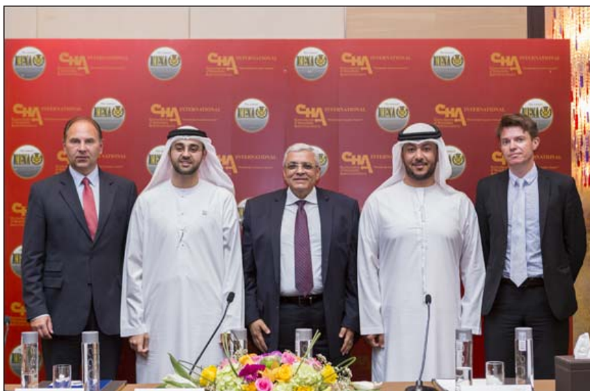
The much-awaited ceremony is back celebrating its 10th Anniversary in UAE; officially sponsored by UAE National Council of Tourism & Antiquities and conveying a special tribute to the race of the performances of the UAE Tourism Authorities in 2013.

April 2014 - The prestigious MENA Travel Award Gala Night will take place once on Wednesday, May 7th, 2014 the last evening of the 2014 Arabian Travel Market, at The Conrad Dubai Hotel in Dubai, United Arab Emirates.